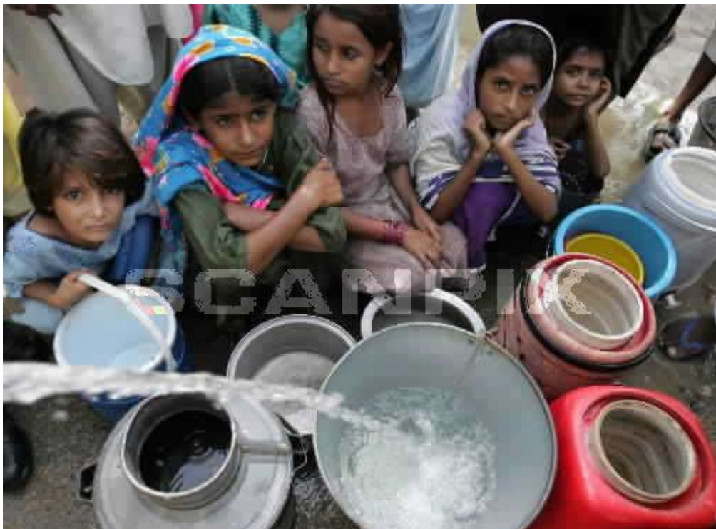
Pakistani children wait to fill their pots with fresh water in Karachi September 20, 2005. Water supplies contaminated with sewage and toxic waste killed at least eight people and led to around 3,500 more being treated in hospital in the Pakistani city.