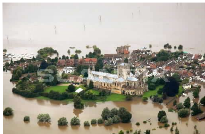
Tewkesbury Abbey is surrounded by floodwater from the River Severn and River Avon, western England, 23 July 2007. The flooding crisis in central and western England continues with thousands of homes losing water and electricity supplies. The Environment Agency said water levels in the county surpassed the devastating floods of 1947.