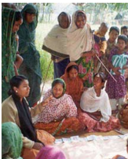
Women in Bangladesh meet to discuss toilet matters.

“Hello!” he shouts happily when my call gets through to a hotel in Dubai. He's on his way to Ethiopia. He sounds like a man who has been proven right