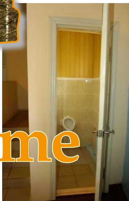
The new indoor toilet was inaugurated in September 2006.