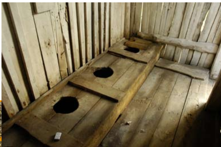
The old outdoor toilet in Bobryk village school.

During the concert, the ceiling lamp flickers. I silently hope that the electricity grid will be able to support all the new installations in the building when the winter comes. ●