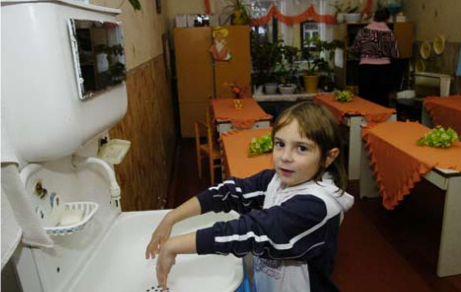
At Vertiivka kindergarten, the pupils know it’s important to wash their hands.